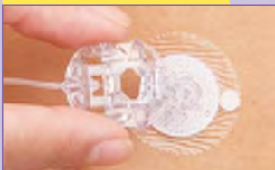
Pinch connector arms to open. Lift off site.