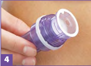
4 Inspect device for adhesive and insertion needle.