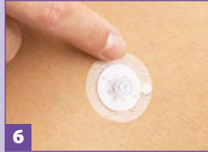
6 Press to secure adhesive.