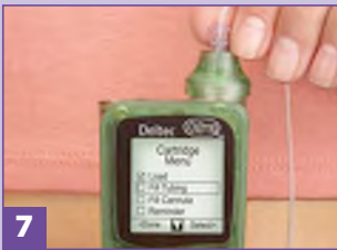
7 Connect the tubing set and fill according to the pump User Manual.