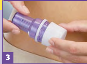
3 Twist cap to remove.