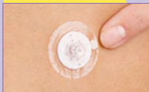
Press finger near peel dot. Peel back adhesive.