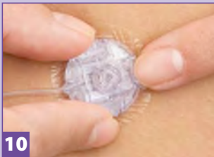
10 Secure connector over site, push together until audible "click."