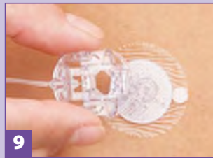
9 Position site connector onto site with tubing in desired direction.