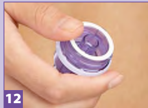
12 Verify needle retracted. If still visible, press down on outer edge until needle retracts fully.