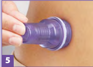
5 Press device firmly on site. Hold for 5 seconds, pull straight off.