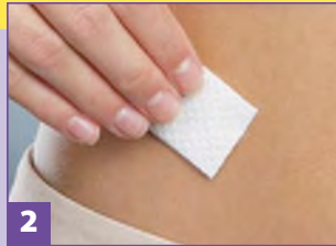
2 Prepare site, allow to dry.